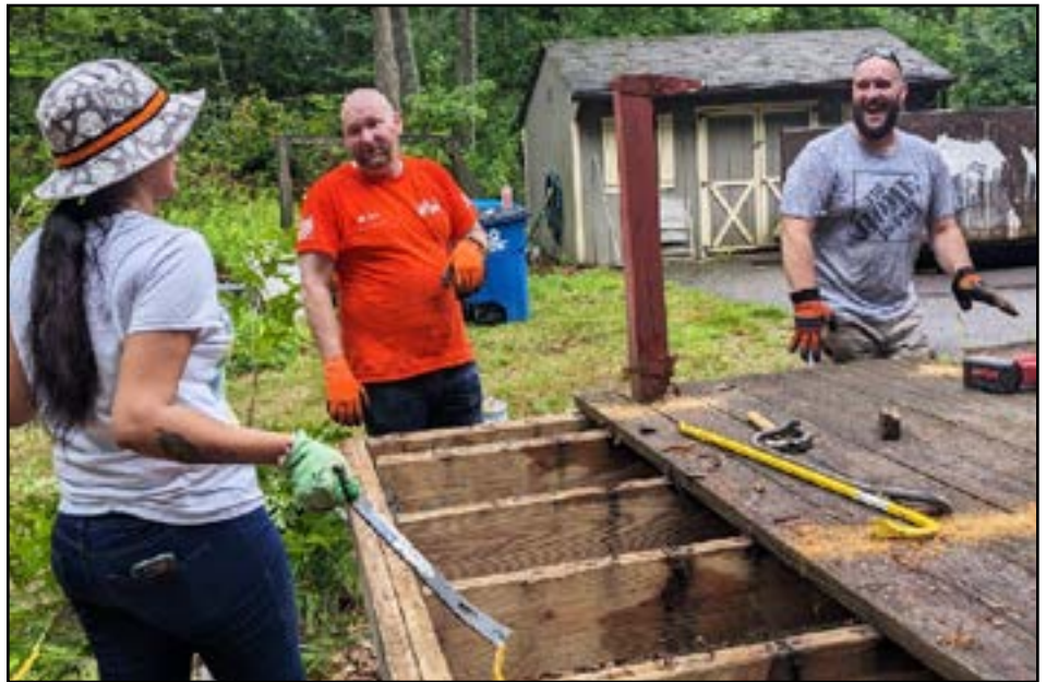
Volunteers from the Westfield Home Depot Distribution Center recently came out to Monson to help demolish a deck in preparation for a veteran repair project.