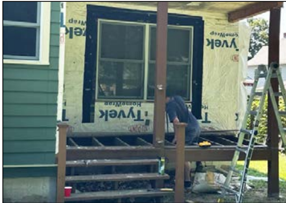
An employee from TNT General Contracting removes the deck from a property in Springfield to make room for a first-floor bedroom and bathroom addition.