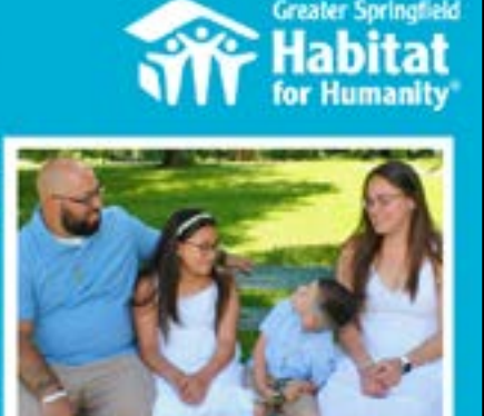
Our home is ... somewhere we can be ourselves.

Building homes, Building opportunities abitatspringfield.org/building-homes