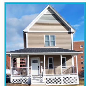
Construction for these Holyoke homes used ARPA funds.