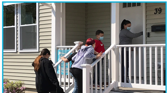
This house in Springfield was built using HOME funds.

OUR ASK: raise budget to $20M for FY '24